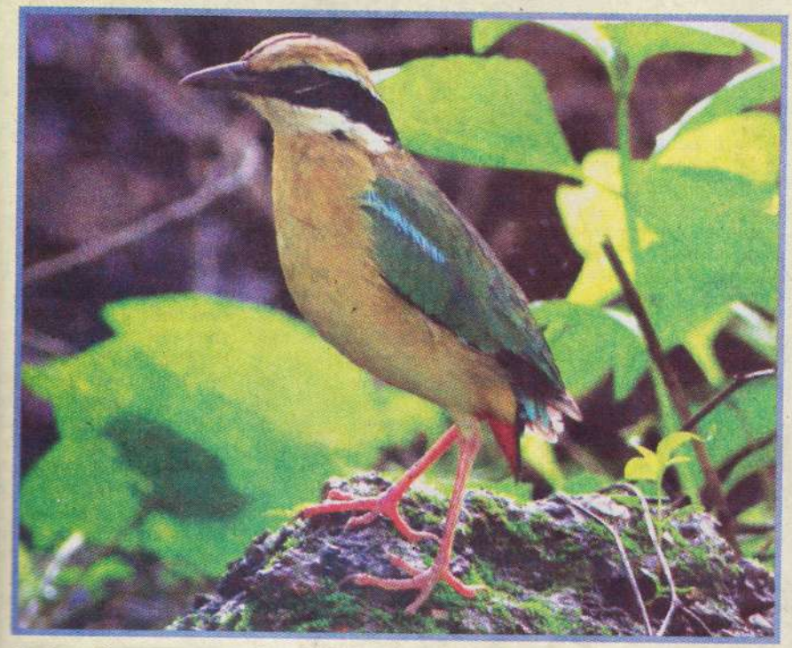
Indian Pitta seen at Capela de Monte in Old Goa.