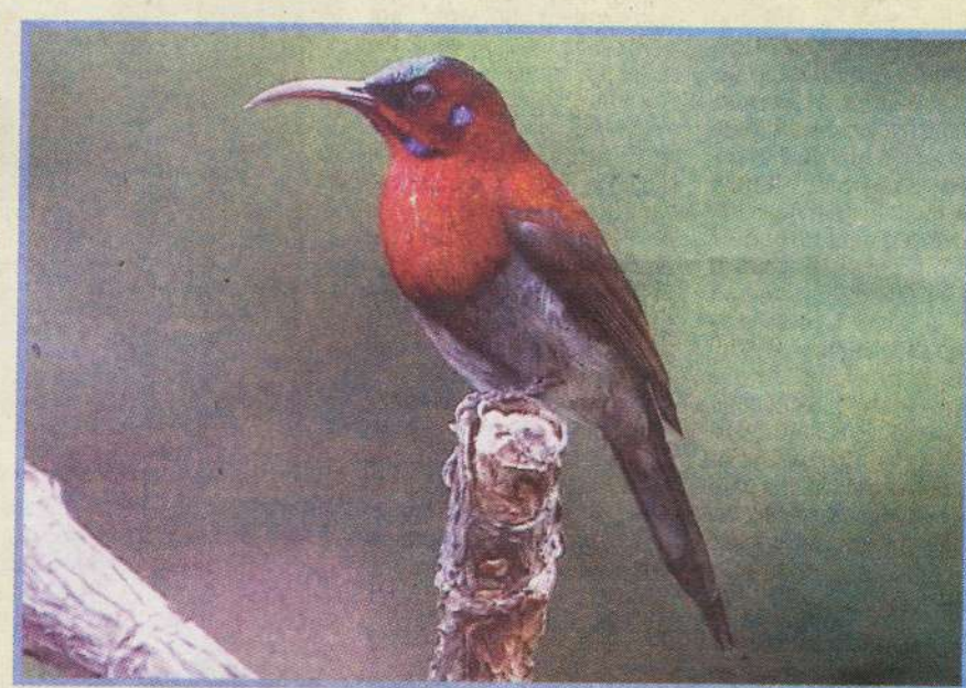
Vigors Sun Bird in St Inez, Panaji.