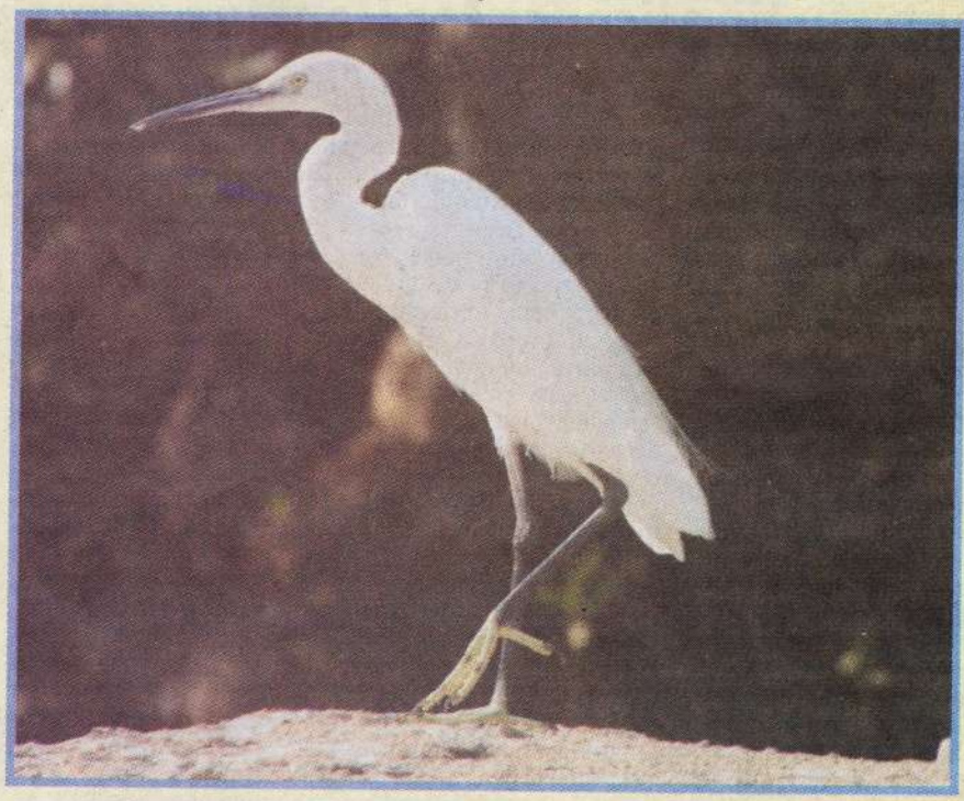
Little Egret found in Salim Ali Bird Sanctuary.